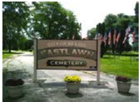
Eastlawn Cemetery 2200 Milwaukee Rd.