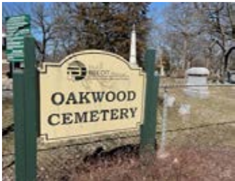
Oakwood Cemetery 1221 Clary St.

For more information including affordable pricing, please contact our City of Beloit Cemetery office: Monday - Friday 10am-2pm 2200 Milwaukee Rd. 608-364-2867 www.beloitwi.gov